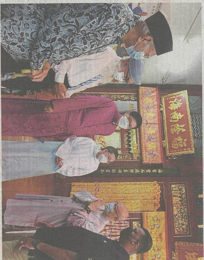
Anwar (left) meeting representatives of the places of worship at the Goddess of Mercy Temple.